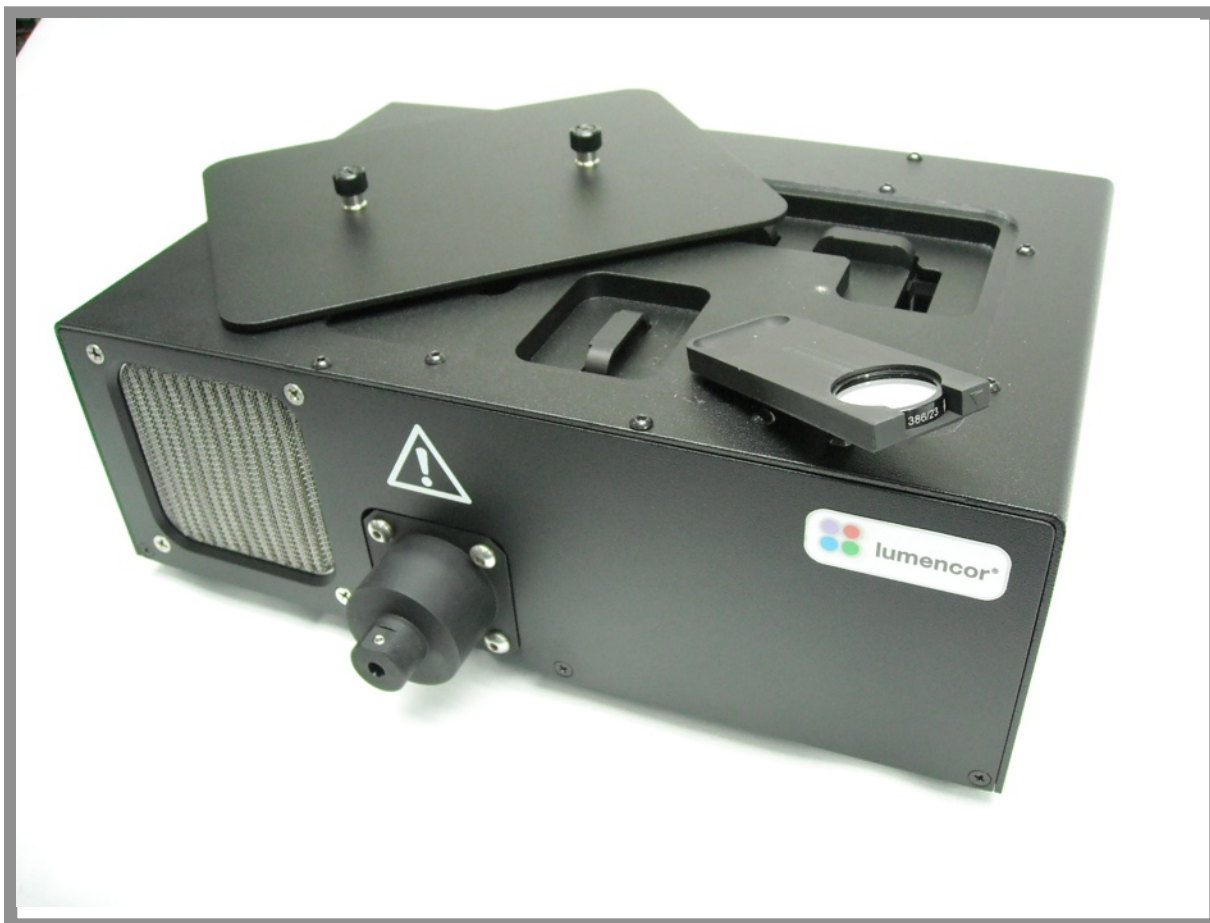
SPECTRA X with removable filter holders

The SPECTRA X has a feature that other SPECTRAs in the product family do not; removable optical excitation filters. There are fixed in the SPECTRA and SPECTRA S. The filters are installed in individual holders which the user can access once the top cover retained by two thumb screws is removed. Refer to the photo below.