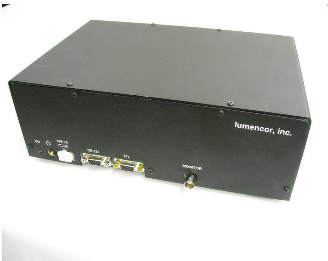
Rear Panel of SPECTRA light engine

The SPECTRA can either be controlled by a Lumencor supplied GUI via a RS-232 port, by the Lumencor Remote Control Accessory (RCA) via the RS-232 port or by a 3 rd party laboratory software program via the TTL port. The GUI provides a quick and easy way to control your new light engine. You will have the ability to turn each source within the unit on/off, adjust the power of each source independently from off to full power, switch between the GREEN and YELLOW excitation filters and also cycle through all sources automatically at a frequency chosen by the user. Refer to the photo below of the rear panel for the location of the various connectors.