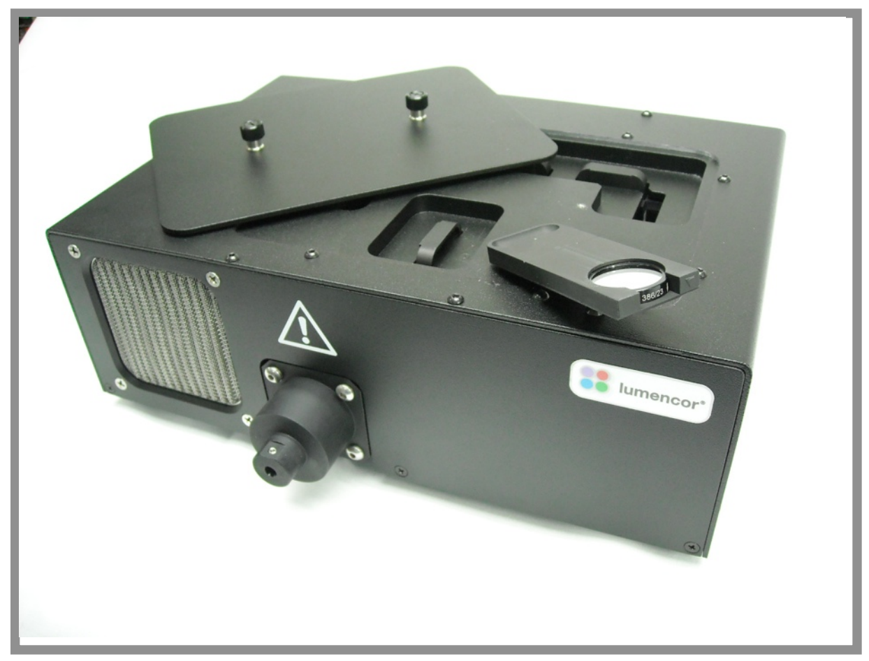
SPECTRA X with removable filter holders

The SPECTRA X has a feature that other SPECTRAs in the product family do not; removable optical excitation filters. There are fixed in the SPECTRA and SPECTRA S. The filters are installed in individual holders which the user can access once the top cover retained by two thumb screws is removed. Refer to the photo below.